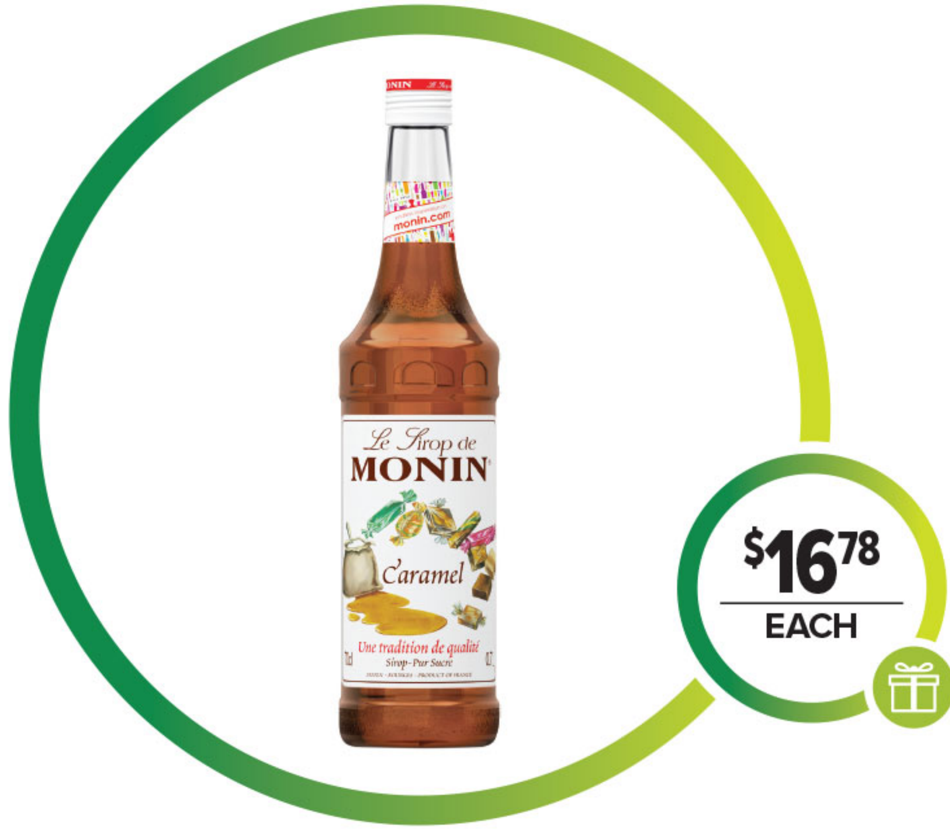
MONIN CARAMEL COFFEE SYRUP 700ML

ADVERTISED SPECIALS AVAILABLE FOR THIS MONTH ONLY WHILE STOCKS LAST