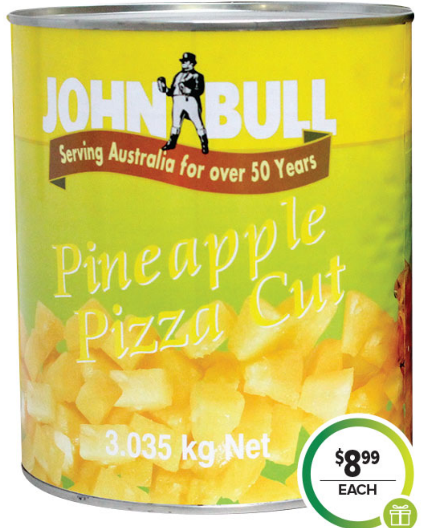
JOHN BULL PINEAPPLE PIZZA CUT 3KG