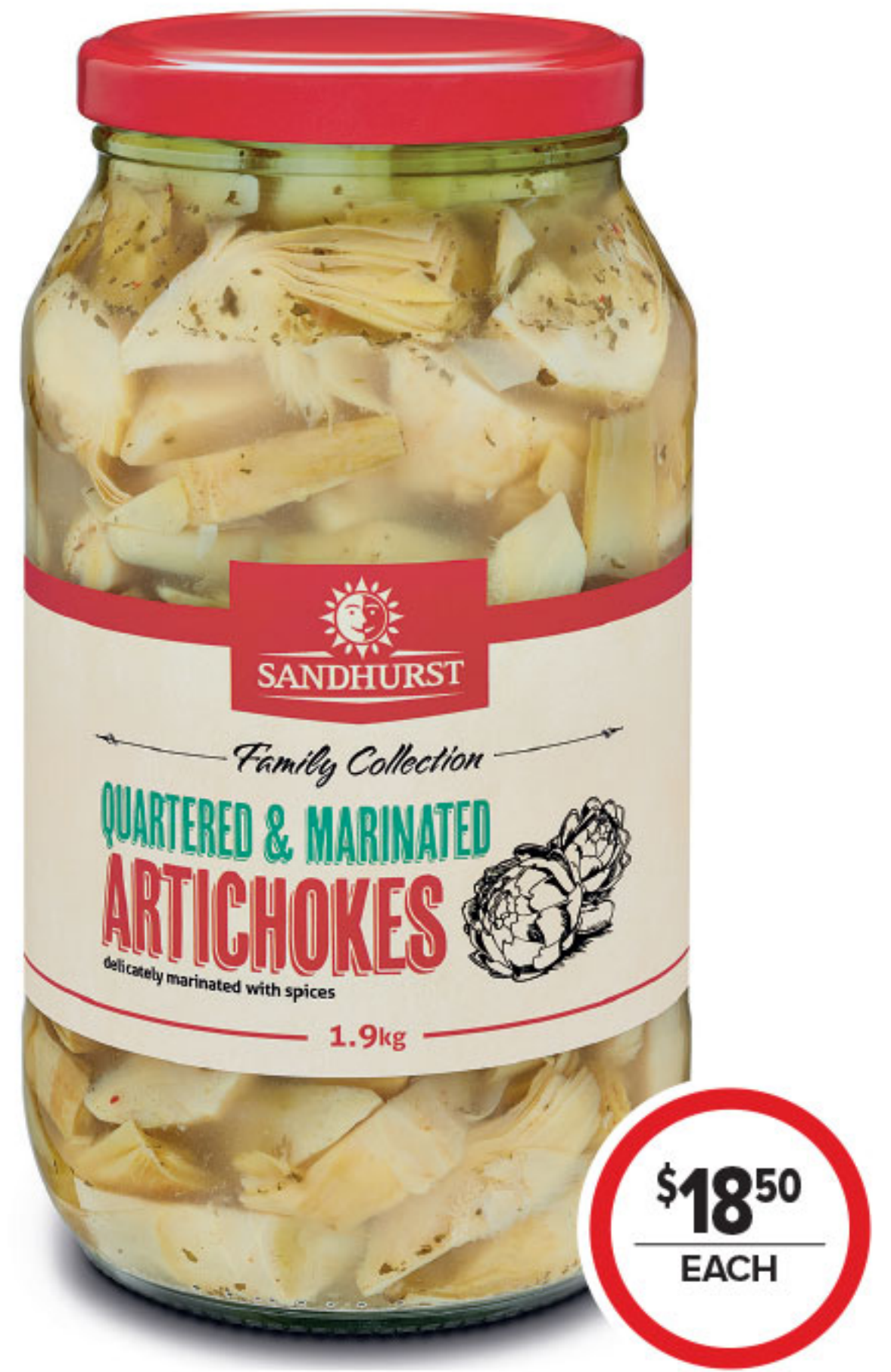
SANDHURST QUARTERED & MARINATED ARTICHOKES 1.9KG