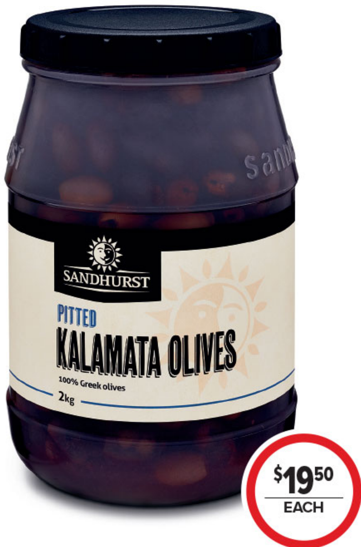
SANDHURST PITTED KALAMATA OLIVES 2KG