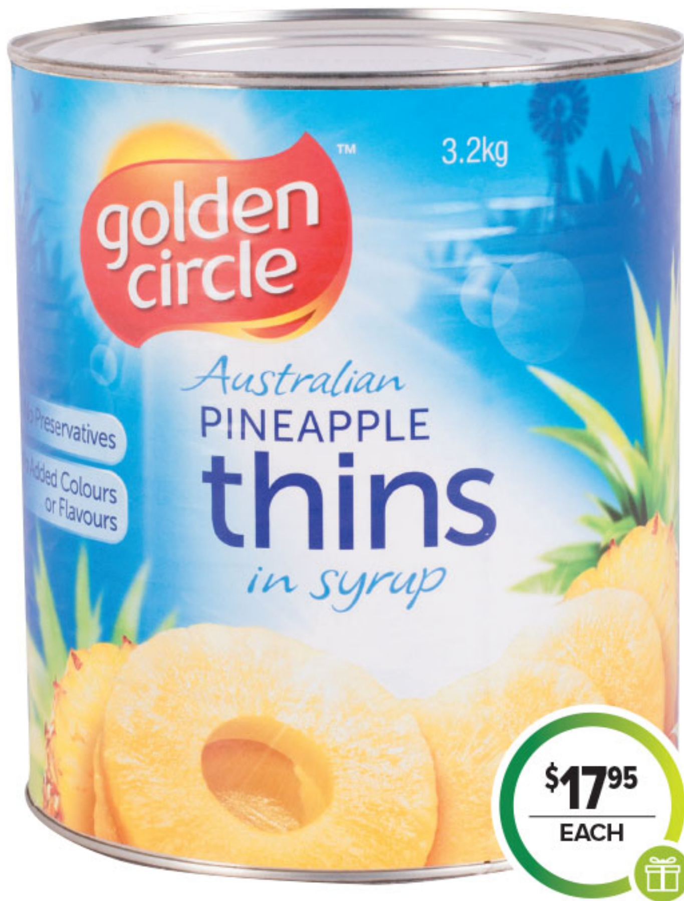
GOLDEN CIRCLE PINEAPPLE THINS 3.2KG