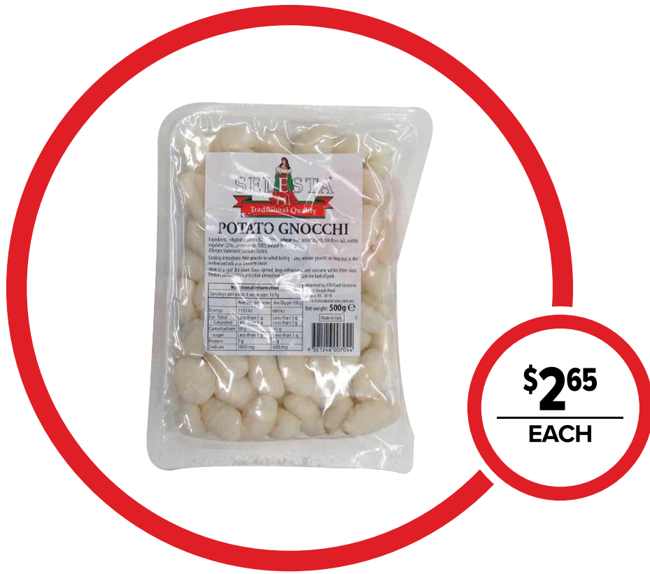
SELESTA POTATO GNOCCHI 500GM

ADVERTISED SPECIALS AVAILABLE FOR THIS MONTH ONLY WHILE STOCKS LAST